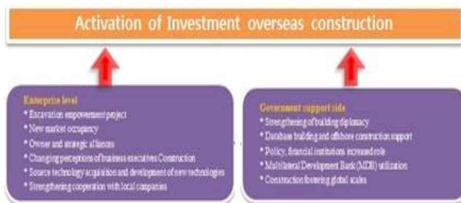
Figure 2. Activation Strategy

Difficulties in financing, the local market of area preponderance, poor profitability, financial support foreign investment, can be separated due to factors such as difficulty of the lack of specialized personnel. These problems derive the consequent expansion strategy was unequal distribution of local Jewish strategy, financing strategy, new markets and new product development strategy, management rationalization strategy, global marketing activities, strategy.