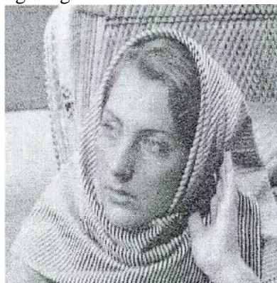
(a) The Original Image

Leave the low-frequency raw sugar f_n like f , then use high frequency detail d_n \cdots d_1 of two-dimensional image reconstruction, and then to edge extraction of the fused images. Because images/after wavelet decomposition, after smooth filtering, the low frequency part, after high frequency filter, the high frequency part, in wavelet decomposition approximation coefficients section, contains the detail of the image information is more and more small, image edge information is decompose step by step to the high frequency part. So can be resolved through the information of high frequency part of the refactoring to extract image edge.