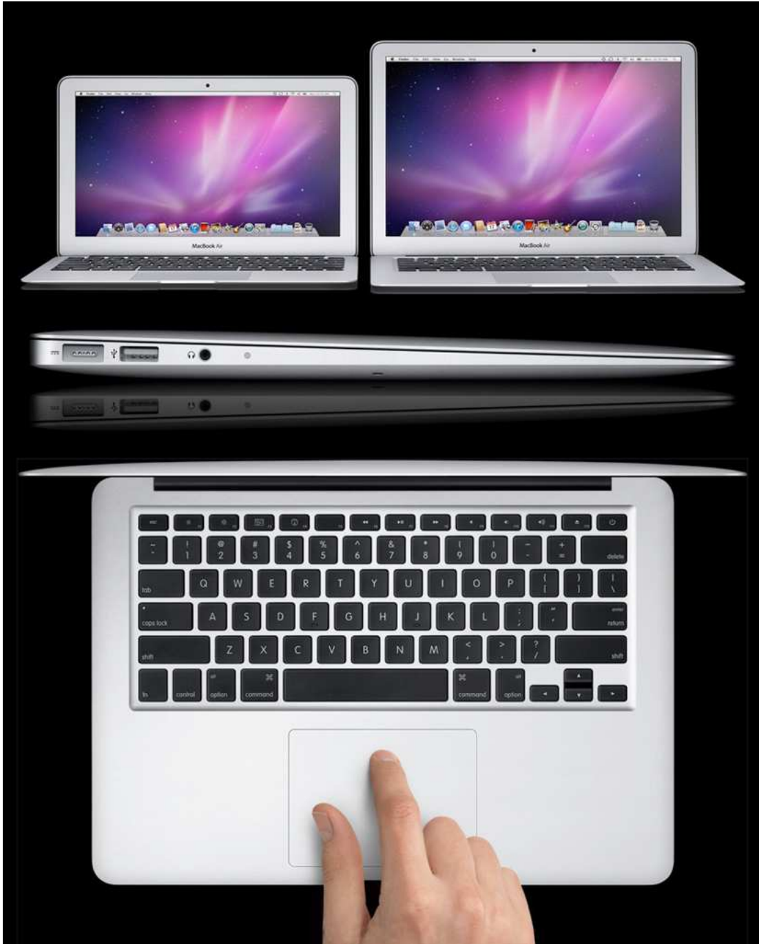
Figure 4. Late 2010 Update to the MacBook Air

The lack of a physical keyboard in the iPad is an issue that concerns some users, but aligns with Apple's tendency as technology evolves to omit what are fast becoming unnecessary features (floppy drive, mouse, optical drive, and now hard drive...?) While an external keyboard can be plugged into an iPad for extensive text entering or editing, the late 2010