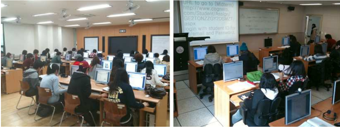
Figure 2. Fixed desktop computer labs inhibit face-to-face group collaboration, while encouraging cheating in online exams

But students are not immune from the ICT revolution; rather, they are among the forefront of those adopting new digital technologies. This adoption is a trend that is increasing exponentially, notwithstanding that they simply take it for granted. As I argue elsewhere [15], this will inevitably affect their expectations of how teaching and learning should occur. At the same time, EFL textbooks are rapidly merging with digital media, and are increasingly being offered online [16]. A number of teachers are already integrating online placement tests, progress tests, and web-hosted Learning Management Systems into their courses [17]. As software and hardware continue to evolve towards providing greater user-friendliness through more intuitive user interfaces, this trend will only continue. In essence, the relationship to digital media in the classroom – as elsewhere - is evolving from that of a precious Internet that can only be accessed as a specialized scarce resource, to that of the taken-for-granted Internet as constant companion. The iPad caters to this new paradigm, as it promulgates it.