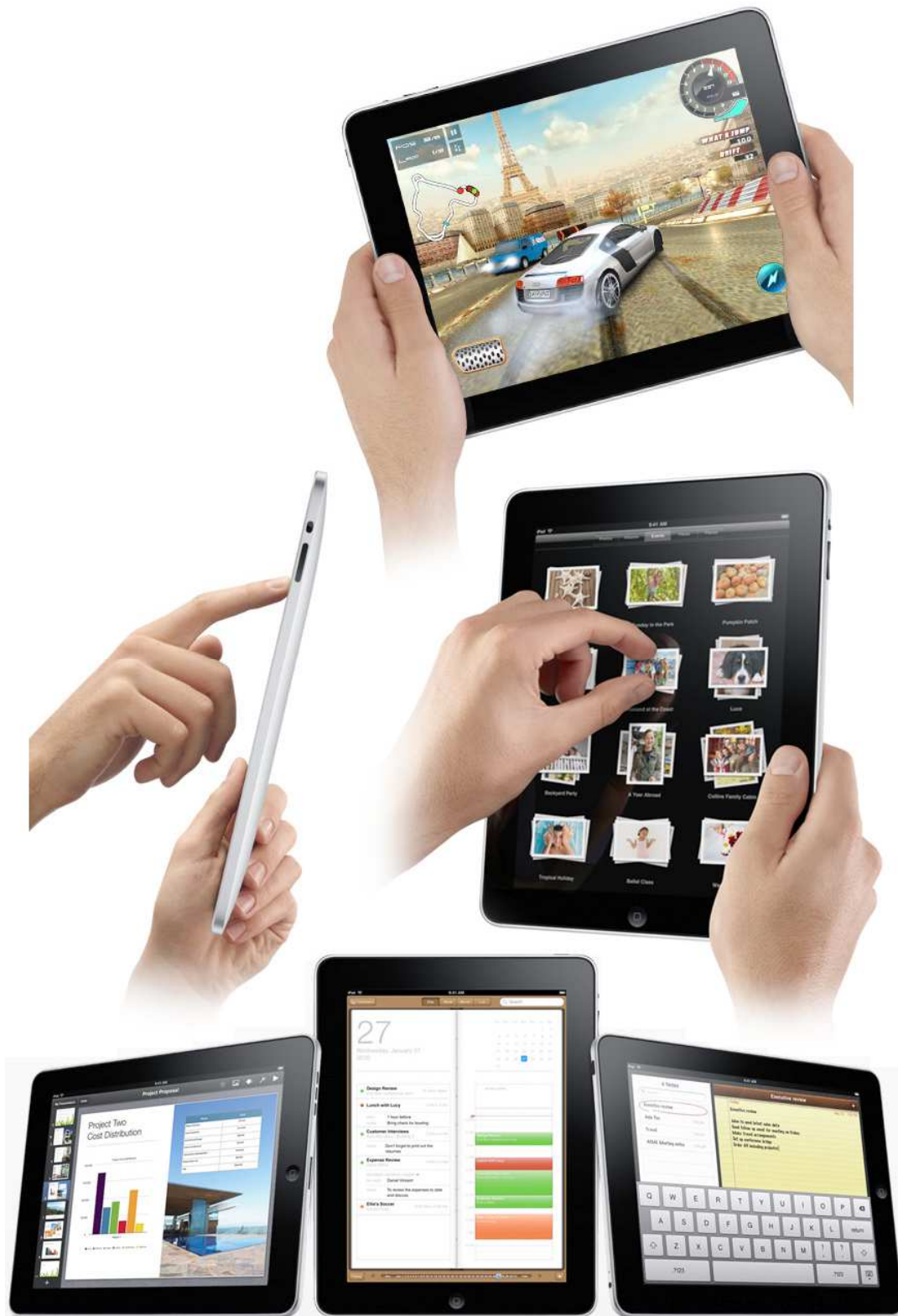
Figure 1. The Apple iPad exploits multitouch gestures and offers many apps