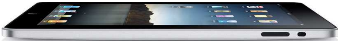
Figure 3. Slim profile of the iPad contributes to its usefulness as a horizontal tablet