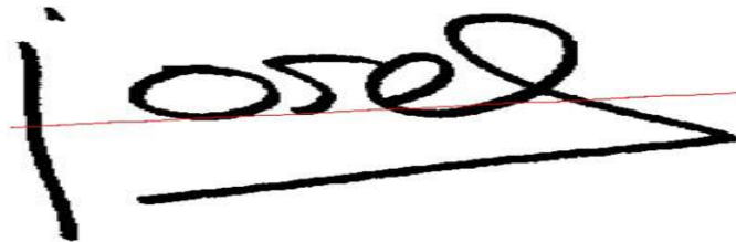
Figure 1. Example of Offline Signature