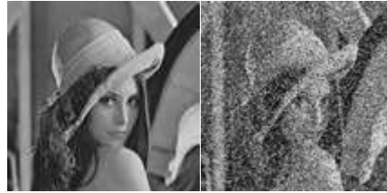
Figure 1. Original and Corrupted Image with Impulse Noise

processed lies in the image pixel intensity value range, then it is an uncorrupted pixel and left unchanged. If the value does not lie within this range, then it is a noisy pixel. If a pixel is a noisy then it is smoothed by applying linear or non-linear noise removal techniques. Figure 1 shows original image along with 30% of pixels corrupted by Salt and Pepper noise.