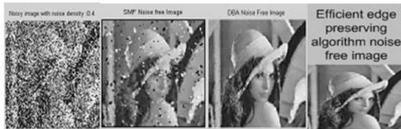
Figure 3. Efficient Edge Preserving Algorithm Applied on Lena Image Corrupted with 40% Noise