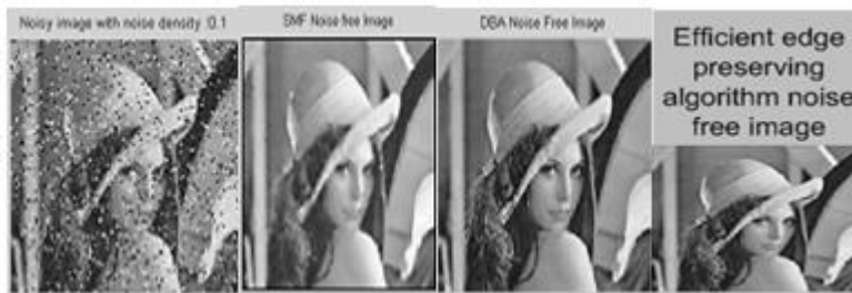
Figure 2. Efficient edge preserving Algorithm applied on Lena image corrupted with 10% noise