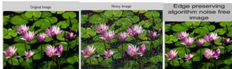
Figure 4. Restored Color Image after Applying Efficient Edge Preserving Algorithm Applied on Color Image