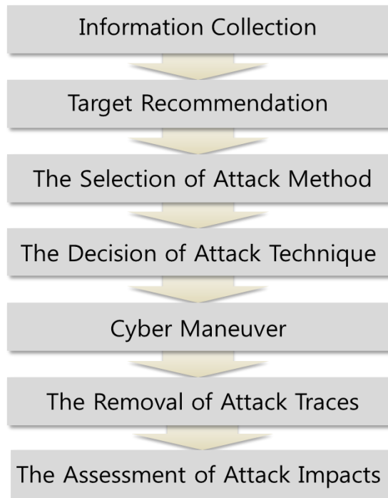
Figure 3. The Process of Cyber Operations