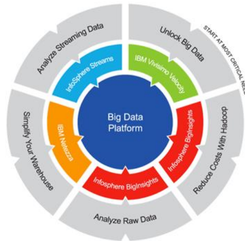
Figure 1. Big Data Platform

In the era of big data, the generation and collection of data is the foundation, data mining is the key. Data mining is the most critical and most valuable work in big data. Usually, data mining or knowledge discovery to find the hidden, unknown but useful information and an engineering model of the potential and systematic process from large amounts of data. Data mining can be summarized in the following 4 characteristics.